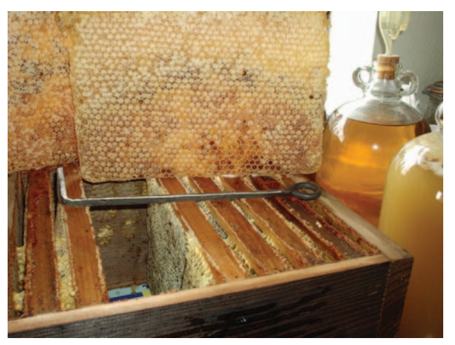
A harvested box yields about 9.6 kg of honey. The 'L' knife is used to cut side comb attachments.

Careful observation will indicate when brood inspection is required. In early spring a colony which is not foraging actively and collecting pollen, is one example. Another is a colony which